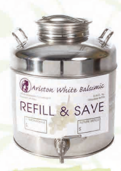
Ariston White Balsamic