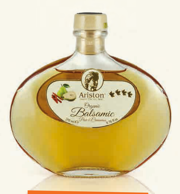
See Page 30 for product details

Pairs well with any fine cheese or fruit. Finishing all dishes including salads, filet mignon, seafood dishes, grilled vegetables, certain desserts, vanilla ice cream, Greek yogurt, gelato, and many more. Also, great for salad dressings and entertaining guests. Even delicious in drinks, smoothies and seltzer water!