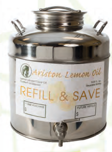
Ariston Lemon Infused Olive Oil