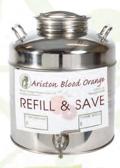
Ariston Blood Orange Infused Olive Oil