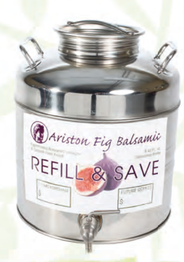
Ariston Fig Balsamic