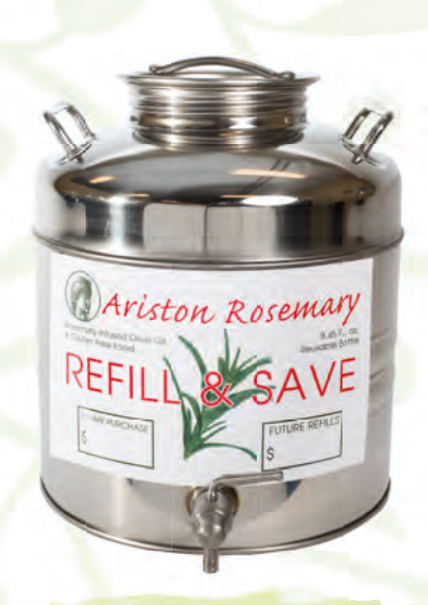
Ariston Rosemary Infused Olive Oil