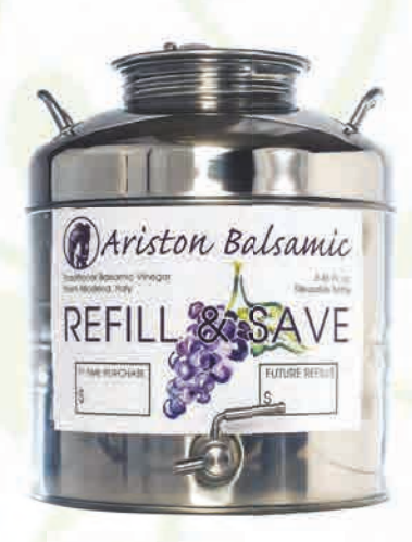
Ariston Balsamic Vinegar