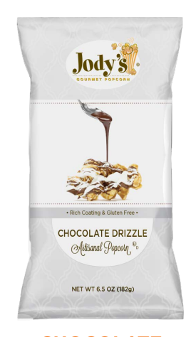
CHOCOLATE DRIZZLE F100/57 6.5 oz. (12 bags/case)