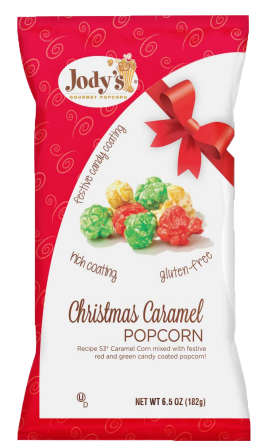
CHRISTMAS CARAMEL CORN CF100/32 6.5 oz. (12 bags/case)

Contains approx. 2 cups. 5" W x 6^{1}/_{2} " H