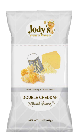
DOUBLE CHEDDAR F100/42 2.2 oz. (12 bags/case)