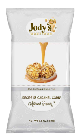
RECIPE 53 CARAMEL CORN F100/53 6.5 oz. (12 bags/case)